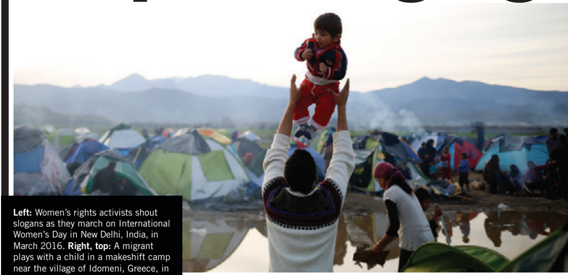
Left: Women's rights activists shout slogans as they march on International Women's Day in New Delhi, India, in March 2016. Right, top: A migrant plays with a child in a makeshift camp near the village of Idomeni, Greece, in March 2016, as they wait to cross the Greek-Macedonian border. Right, bottom: A homeless person sits on the sidewalk as holiday shoppers admire displays in the windows of a downtown department store in Toronto.