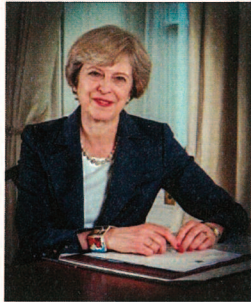
THE PRIME MINISTER