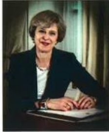
THE PRIME MINISTER