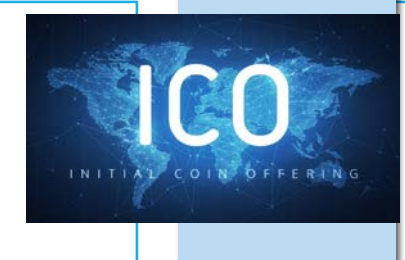
Regulating unregistered cryptocurrency ventures, exchanges, and ICOs/ITOs