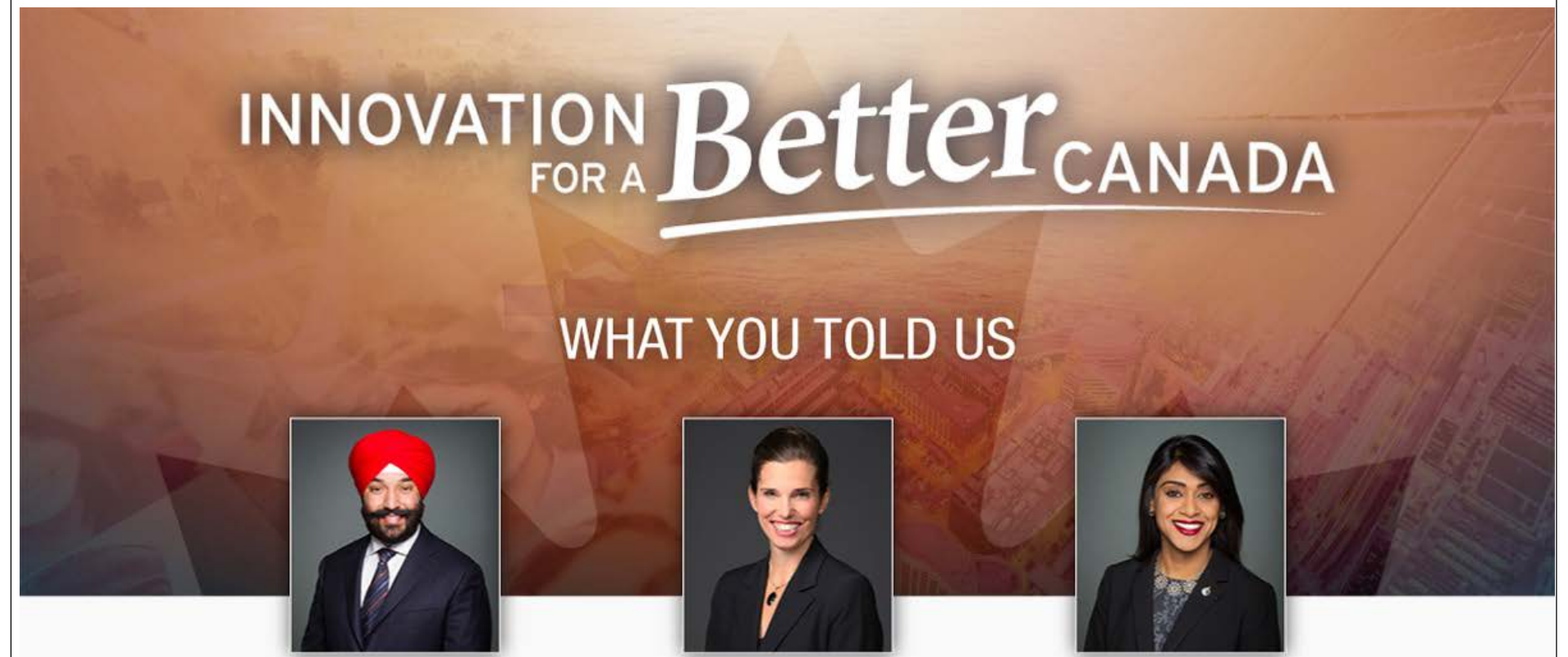
THE HONOURABLE NAVDEEP BAINS Minister of Innovation, Science and Economic Development

In Way of Conclusion (aka: Canada's Response to the Changing Reality)