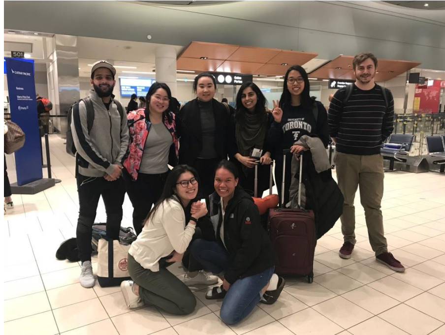
The ICM team at YYZ on February 15th, 2018, ready for departure!